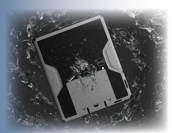
IP68 DUST AND WATER RESISTANCE LUMEN is designed to better withstand the challenges of the emergency room and frequent disinfection