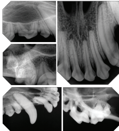
Three Sizes Available

Save Time - No more time spent needlessly developing film. Instantly diagnose your patient.