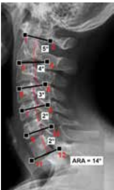
Absolute Rotation Angle